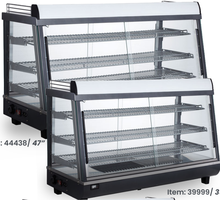
Item: 44438 / 47"