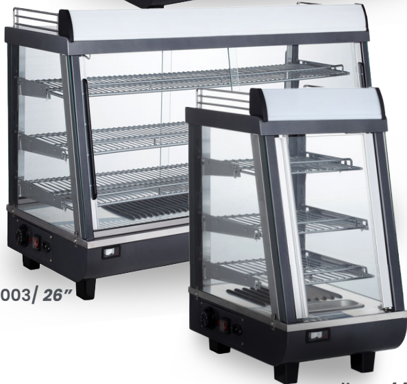
Item: 40003 / 26"